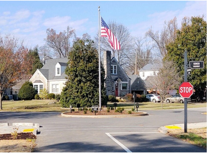
It's kind of hard to see the plantings right now, but wait until next spring and we'll see Coreopsis, Hibiscus, Allium—lots of color!