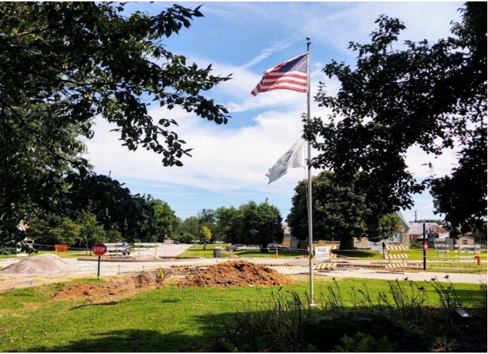
None of us miss the days of construction.....

Approaching the island, all motorists should stop at the STOP sign, then turn to the right, in a counter-clockwise direction. Just as you would in any intersection, if another motorist is driving around the island, wait until he or she turns onto a street before pulling out. If you are riding a bicycle, remember to follow the traffic pattern!